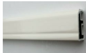
4 sections of Aluminium framing cut to size