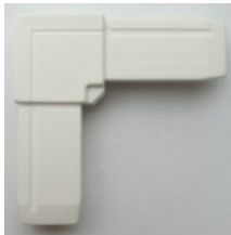
4 corner pieces

Each fly screen kit contains the following items which will build 1 complete fly screen