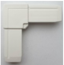
4 corner pieces

Each fly screen kit contains the following items which will build 1 complete fly screen