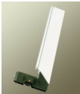
8 sections of inner frame for 2 panel slider