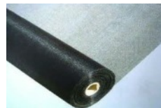
Fly mesh for 2 panels