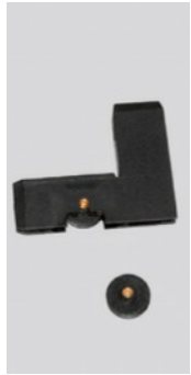
8 corner pieces, 4 with wheels inserted

Each fly screen kit with 2 panels contains the following items