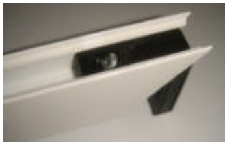
4 Sections of outer frame with 4 corner pieces