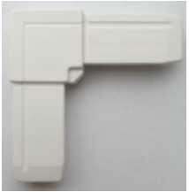
4 corner pieces

Each fly screen kit contains the following items which will build 1 complete fly screen